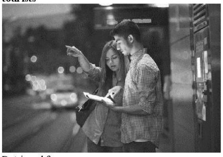
Retrieved from: http://helenadailyenglish.com/everyday-englishconversations-practice-lesson-12-askingdirections.html