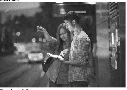
Retrieved from: http://helenadailyenglish.com/everyday-englishconversations-practice-lesson-12-askingdirections.html