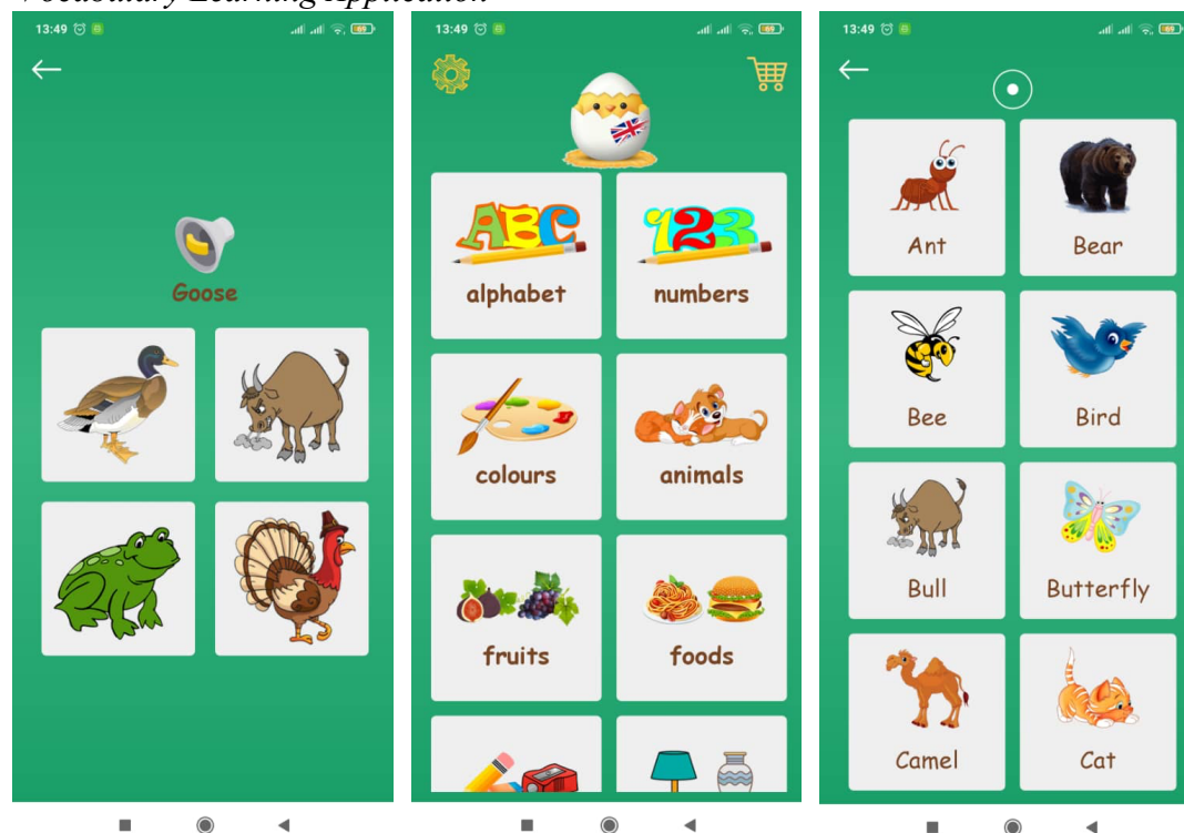
Figure 1. Vocabulary Learning Application

In order to test the participants' vocabulary knowledge prior to and after the treatment, a receptive vocabulary size test which is designed for young non-native speakers of English up to eight years old was used (Figure 2). The Picture Vocabulary Size Test (PVST) (Anthony & Nation, 2021) is a standard and validated test that measures the receptive knowledge of the 6000 most frequent words in English based on British National Corpus and Corpus of Contemporary American English (BNC/COCA) word lists (Nation, 2012). The PVST is currently available in two versions, and measures the test takers' ability to find an appropriate picture (i.e. meaning) for a given word presented in a partly contextualized form. Each version of the test contains 96 items, and all questions are developed based on a similar design procedure. The PVST runs on standard computers using Microsoft Windows, Macintosh OS X, and Linux operating systems. A sample item from the PVST is shown in Figure 2. In order to answer the question, the test taker should first play the sound, and then select a picture which represents the word.