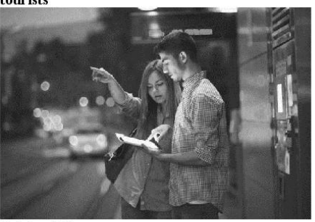
Retrieved from: http://helenadailyenglish.com/everyday-englishconversations-practice-lesson-12-askingdirections.html